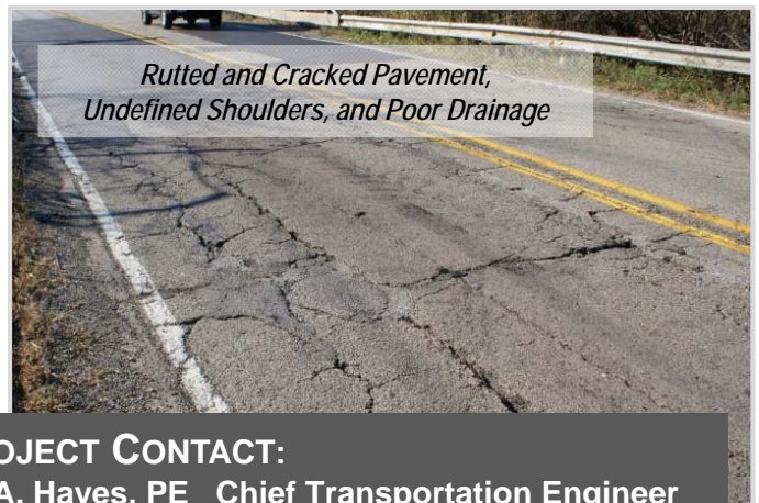
Rutted and Cracked Pavement, Undefined Shoulders, and Poor Drainage