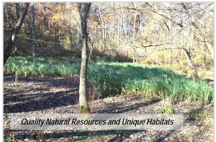
Quality Natural Resources and Unique Habitats