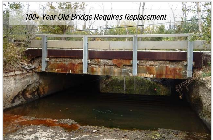
100+ Year Old Bridge Requires Replacement