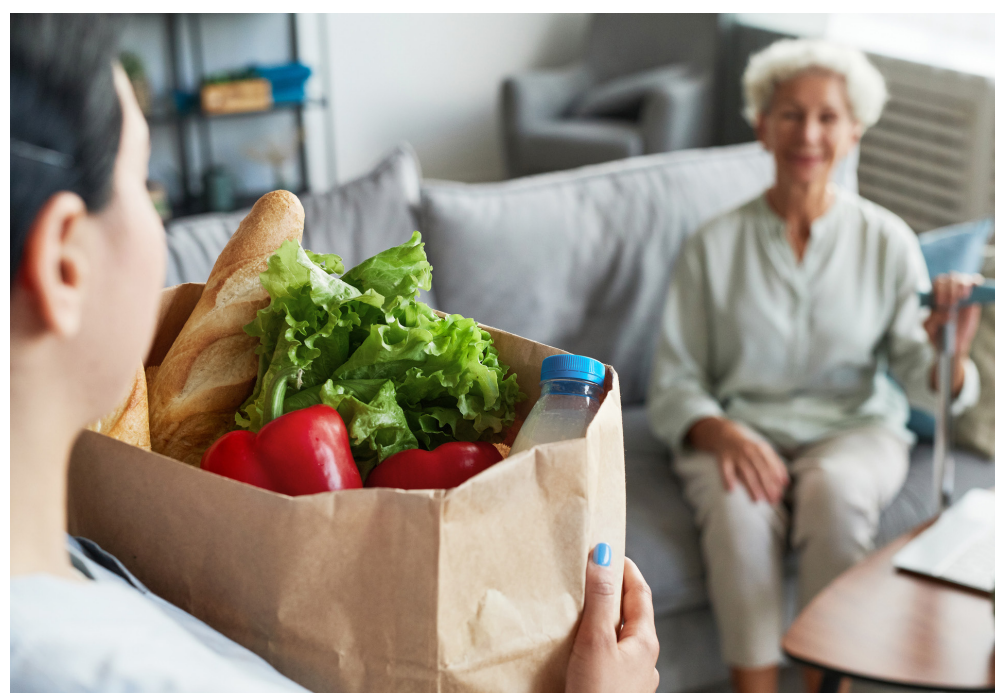
Offer to run errands. Offering to relieve the caregiver of a seemingly simple or mundane task will provide a breath of fresh air and relief to a caregiver.